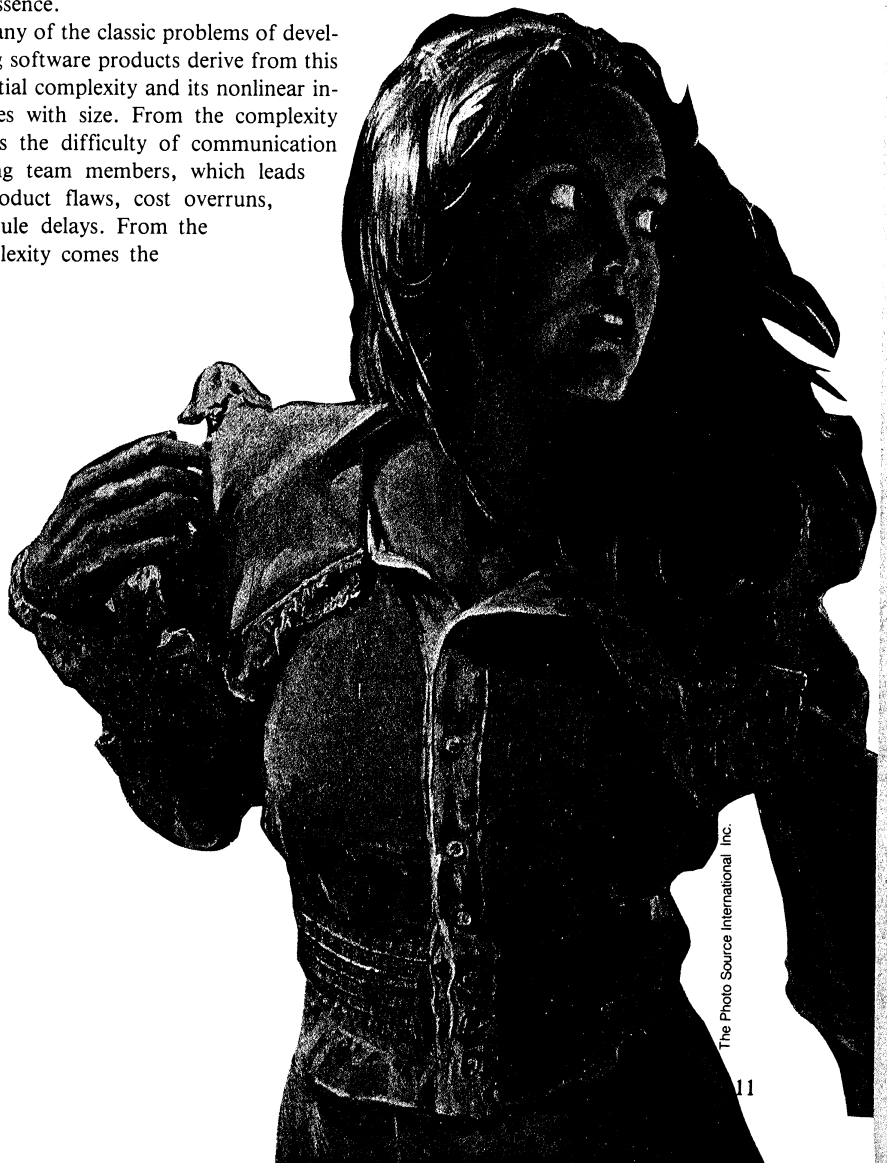
The Photo Source International Inc.

Conformity. Software people are not alone in facing complexity. Physics deals